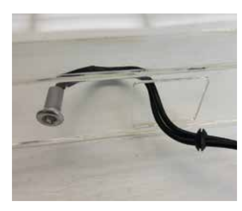
4. Grommet Replacement Pull the wires out through the routed holes next to the 11/32" hole. Slide grommet over both wires and push it up to the silver of the light.