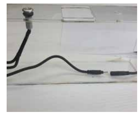
6. Daisy Chain The daisy chain system allows for one light to be plugged into the next. Connect this light with other Star Brights or run it through a hole in the post to continue the daisy chain to the next rail section.