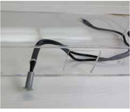
3. Slide Slide wires through 11/32" hole pushing the LED light flush.