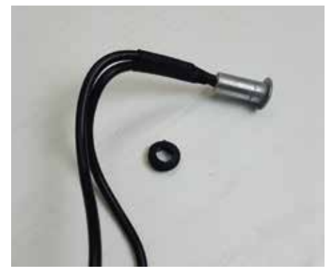
2. Grommet Remove the grommet completely from the wires.