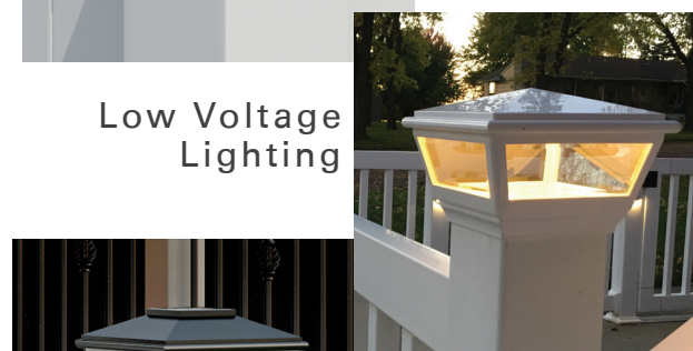
Low Voltage Lighting