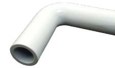
90 Degree Inside/Outside Corner