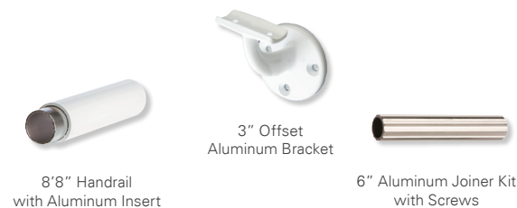
8'8" Handrail with Aluminum Insert

Combine easy-to-use accessories with attractive styling, unrivaled quality, strength and durability, and one thing is clear: the Summit® product line is the industry's finest.